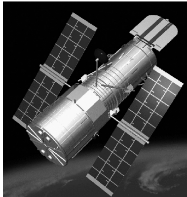
Fig. 1: The Hubble Space Telescope

For satellites and space probes based in the inner Solar System, solar panels are the most common generators of electricity. They consist of large arrays of photovoltaic cells and are characterised by the amount of electrical power that can be generated per unit mass. A typical value for panels used on satellites in Earth orbit is 300\text{Wkg}^{-1} . Perhaps the most familiar set of satellite panels belongs to the Hubble Space Telescope (Fig. 1) on which there are two large arrays. 15