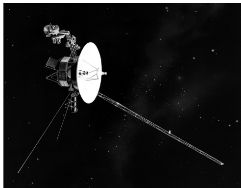
Fig. 3: Voyager 1 – one of the most successful space probes so far

Thermal energy is produced from the natural decay of the isotope, plutonium-238, which emits 5.5 MeV alpha particles. A voltage is then generated using a thermocouple. With the half-life of the isotope being 87.7 years, there is no danger of the energy “running out” and RTGs have proven to 35 be extremely reliable. They have powered some of the most successful missions ever undertaken, such as the Voyagers of the 1980s (Fig. 3) and the more recent Cassini-Huygens probe to Saturn.